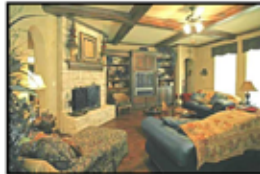
405 Hogans Dr-Trophy Club $799,900