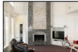
4508 Cresthaven Dr.-Thornbury $889,900