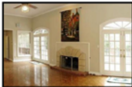
4402 Eaton Circle-Woodland Hills $674,900