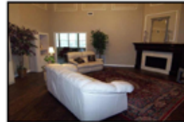
4827 Lakeside Dr.-Brook Meadows $549,000