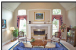
4500 Lakeside Dr.- Thornbury $725,000