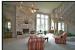
4807 Meandering—Thornbury $639,900