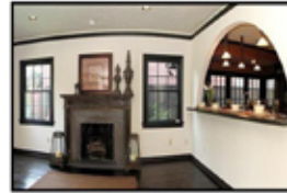
3405 Stanford Dr.-University Park $1,299,900

DURING THE HOLIDAY SEASON THE FIREPLACE SEEMS TO BE A FOCAL POINT OF GATHERING PEOPLE TOGETHER FOR GOOD TIMES, GOOD CHEER, AND MEMORABLE MOMENTS WITH FAMILY & FRIENDS. HERE ARE JUST A FEW THAT ARE FOR SALE.